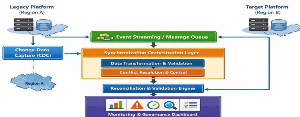
Fig. 1. Hybrid synchronization architecture enabling parallel operation between legacy and target international platforms.

The hybrid synchronization architecture provides the technical foundation required to maintain system reliability during international platform transitions. By integrating controlled replication pipelines, orchestration services, and validation mechanisms, organizations can ensure consistent data synchronization while gradually shifting workloads between operational environments.